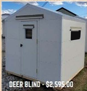
DEER BLIND - $2,595.00